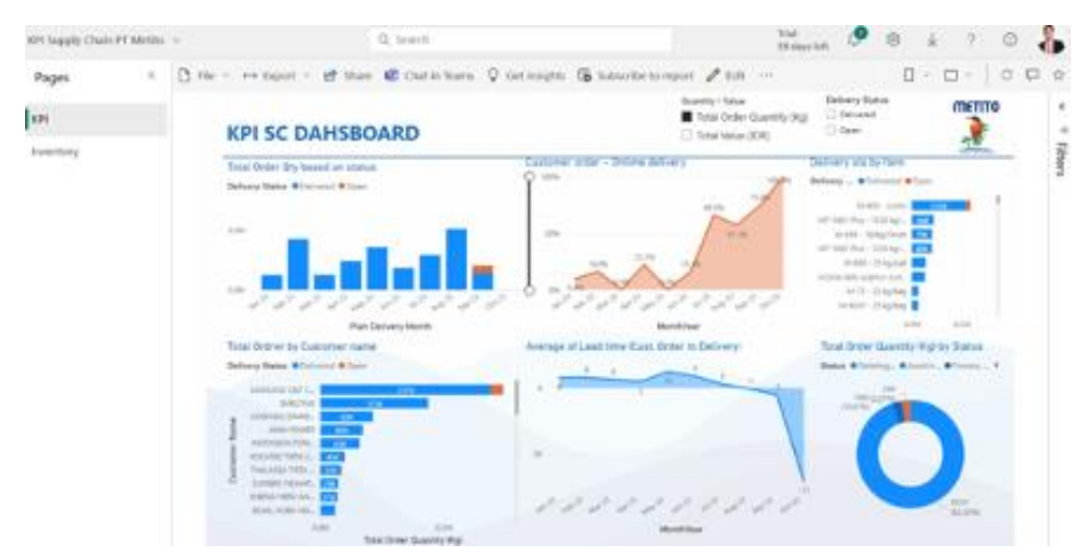
Figure 2. KPI SC Dashboard

Figure 3 shows KPI (Key Performance Indicator) data on SC Dashboard based on customer name. Customers with the largest number of orders are Samsung at 277K, followed by Smelting at 175K, Cogindo at 85K, Jawa Power at 69K, Indonesia Power at 63K, Rochtec at 40K, Thalassa Tirta at 32K, Sumber Indah at 29K, Energi Hero at 27K, and Bexal Hubb at 0.0M. The total order quantity is 0.2M (200,000 kilograms).