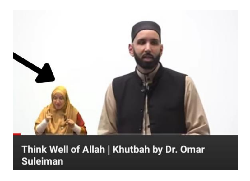
(Yaqeen Institute, 2016)