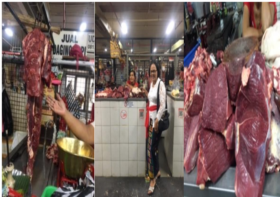
Figure 1. Beef In Badung Market

Technological feeding on cattle farms has shown that cows fed the feed have a better physical composition of carcasses, such as a higher percentage of meat, a lower percentage of fat, and a better percentage of bones, which is 55%, while cattle fed with traditional feed only have a percentage of meat of 50%. In addition, cows fed with technology feed also have a lower percentage of fat, which is 10%, while cows fed traditional feed have a percentage of fat of 15%. The percentage of cow bones fed with technology is also better, which is 35%, while cows fed traditional feed only have a bone percentage of 30%.